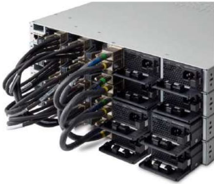
Figure 7. Cisco Catalyst 9300 Series StackPower