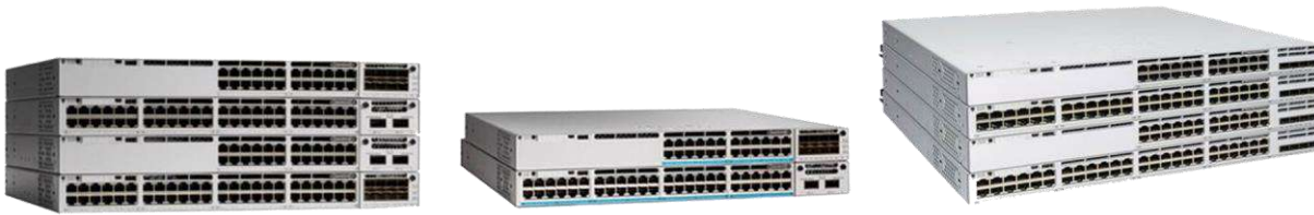
Figure 1. Cisco Catalyst 9300 Series switches

The Cisco Catalyst 9300 Series is made up of nineteen modular uplink switch models and fourteen fixed uplink switch models.