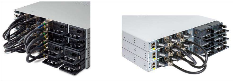
Figure 5. Cisco Catalyst 9300 Series modular uplink models stack (C9300/C9300X SKUs) and fixed uplink models stack (C9300L SKUs)

Cisco Catalyst 9300 Series switch models are designed for stacking switches as a single virtual switch, enabling customers to have a single management plane and control plane for up to 448 access ports.