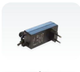
24 V 1.5 A power adapter