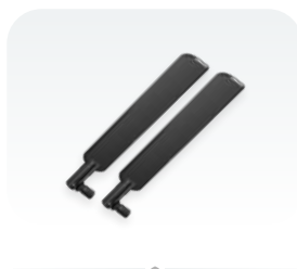
HGO indoor antenna kit