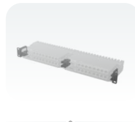
Rackmount kit K-79