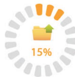
Wireless G Performance