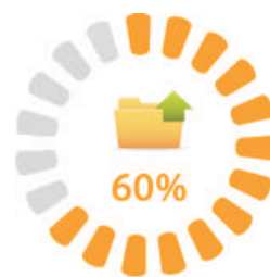
Wireless N Performance

The W311MI uses Wireless N 150 technology to provide increased speed and range than the previous 802.11g standard, giving you a faster, more reliable connection, making it ideal for email, web browsing and file sharing in the home.