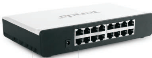
Side Vent Bottom Vent 94V0 Fireproof Plastic Housing