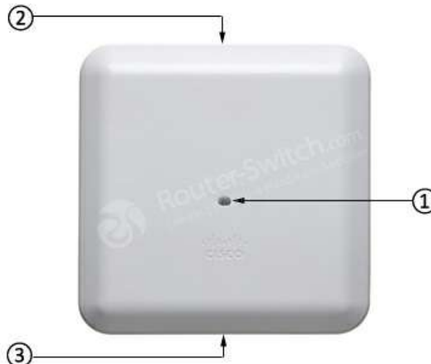
Figure 1 shows the face of the AIR-AP3802I.