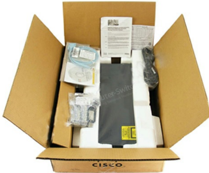
Figure 4 shows the unboxing view of WS-C2960+24TC-S.