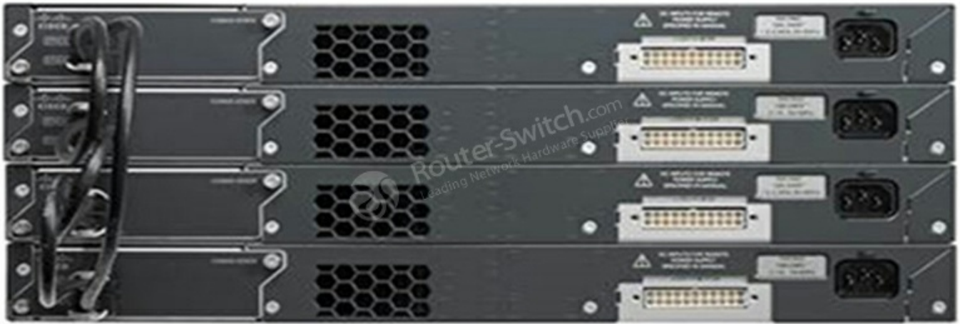
Figure 5 shows the unboxing view of WS-C2960X-48LPS-L.