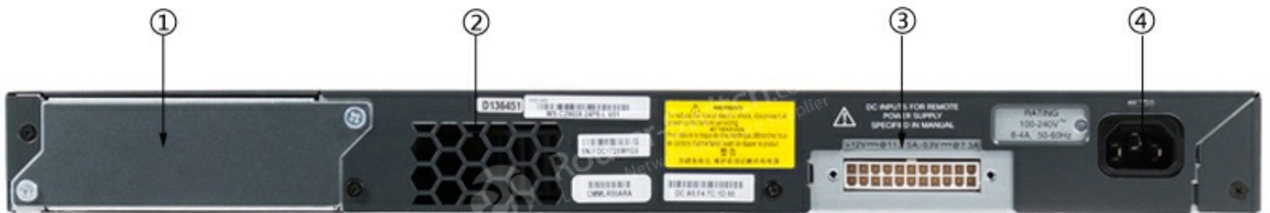
Figure 3 shows the back panel of the Cisco Catalyst 2960X-48LPS-L switch.

Power over Ethernet Plus(PoE+) supports up to 370W of PoE budget for 12 ports with 30W per port or 24 ports with 15.4W per port or 48 ports with 7.4W per port.