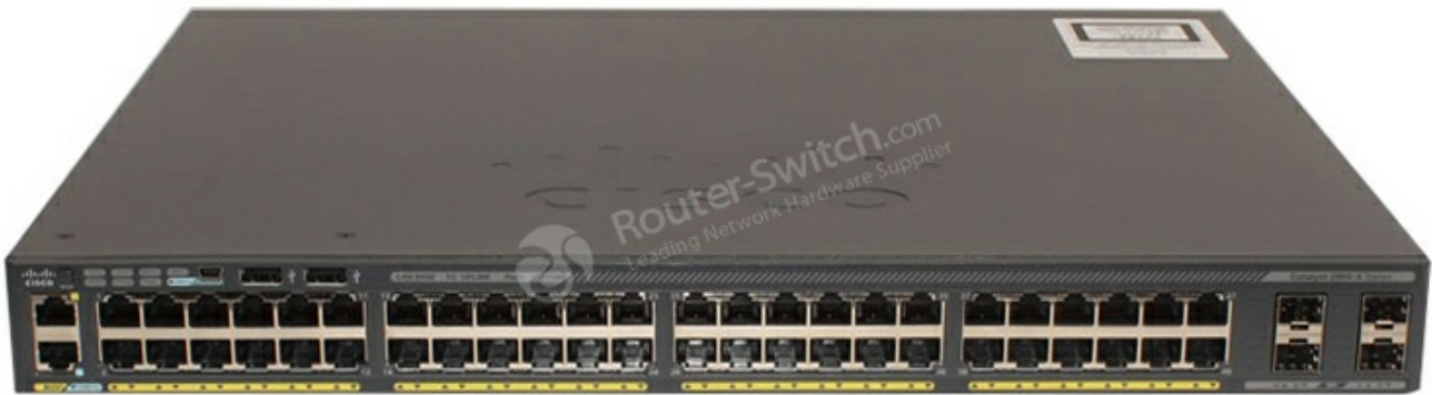
Table 1 shows the Quick Specs.

Figure 1 shows the appearance of WS-C2960X-48LPS-L.