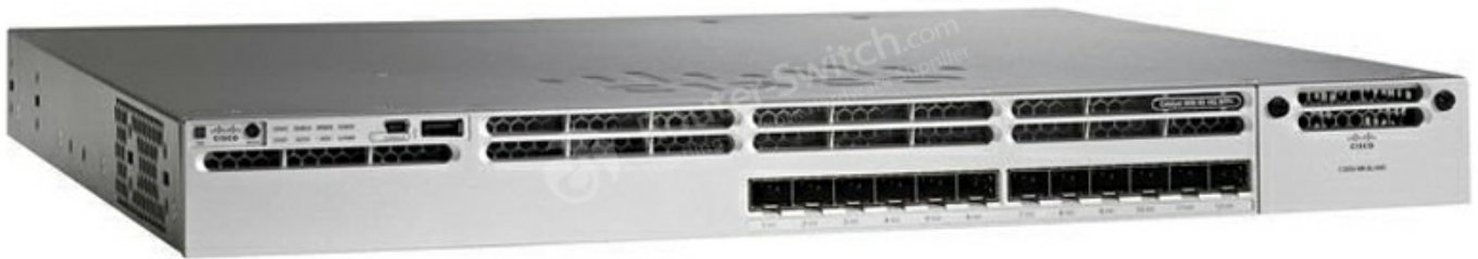
Table 1 shows the Quick Specs.

Figure 1 shows the appearance of the Cisco Catalyst WS-C3850-12S-S.