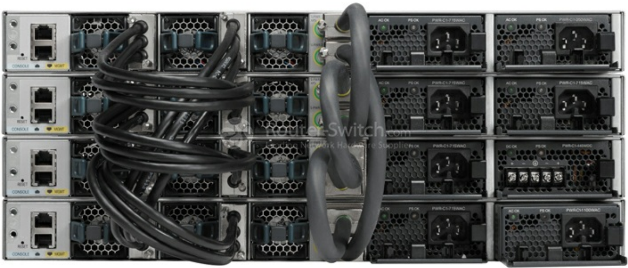
Figure 5 shows the unboxing view of WS-C3850-12S-S.