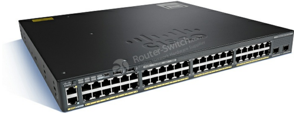
Table 1, WS-C2960X-48TS-LL Specs.

Figure 1 shows the appearance of WS-C2960X-48TS-LL.