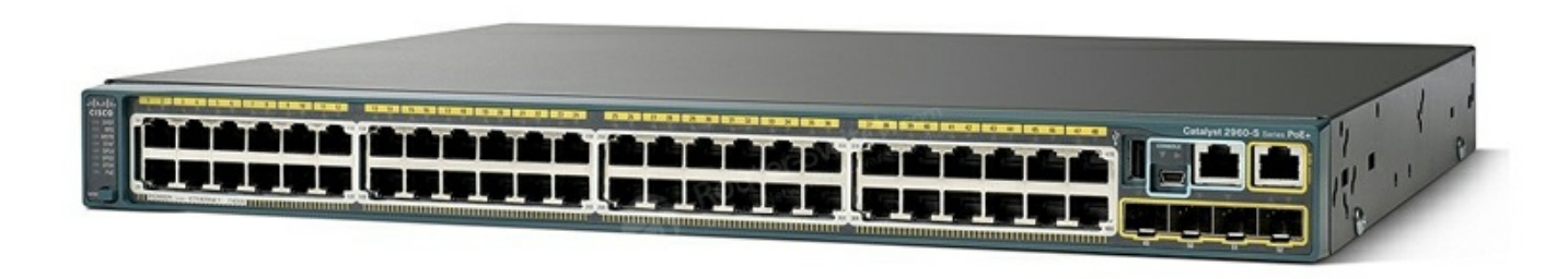
Table 1 shows the Quick Spec of the WS-C2960S-48FPS-L.

Figure 1 shows the appearance of the WS-C2960S-48FPS-L.