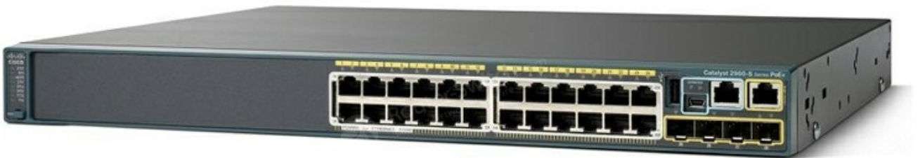
Table 1 shows the Quick Spec of the WS-C2960S-24TS-L.

Figure 1 shows the appearance of the WS-C2960S-24TS-L.