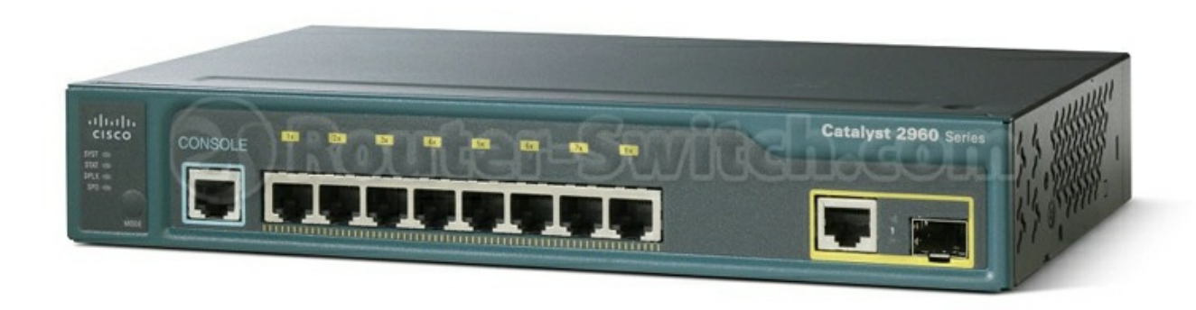
Table 1 shows the Quick Spec of the WS-C2960-8TC-L.

Figure 1 shows the appearance of the WS-C2960-8TC-L.