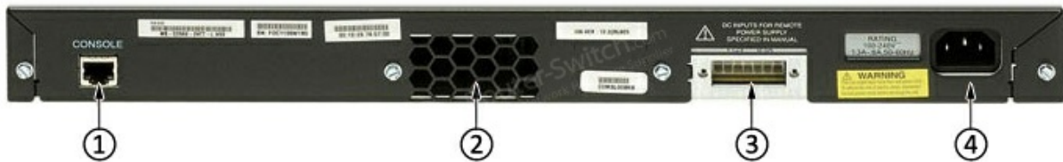
Figure 3 shows the back panel of the Cisco 2960-24TT-L switch.