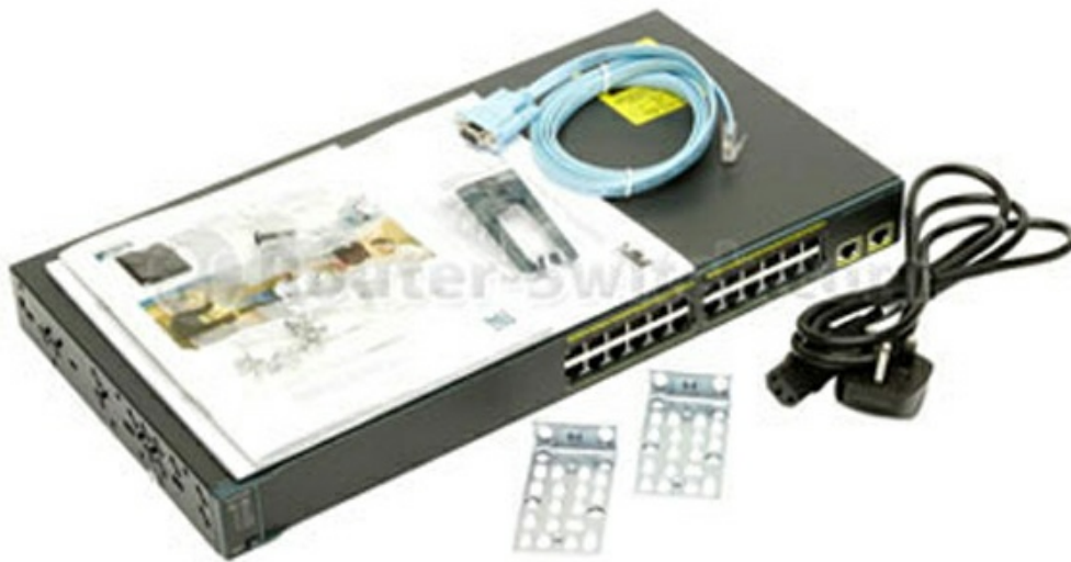
Table 1 shows the Quick Spec of the Cisco 2960-24TT-L switch.

Figure 1 shows the appearance of the Cisco WS-C2960-24TT-L switch and its accessories.