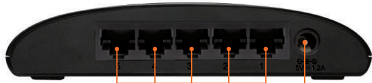
5 RJ-45 10/100 BASE-TX PORTS Connects to computers, print servers, or network storage