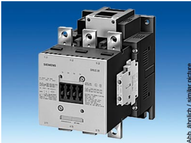
Abb. ähnlich / similar picture

CONTACTOR, 110KW/400V/AC-3 AC(40...60HZ)/DC OPERATION UC 220-240V AUXILIARY CONTACTS 2NO+2NC 3- POLE, SIZE S10 BAR CONNECTIONS CONVENT. OPERATING MECHANISM SCREW TERMINAL